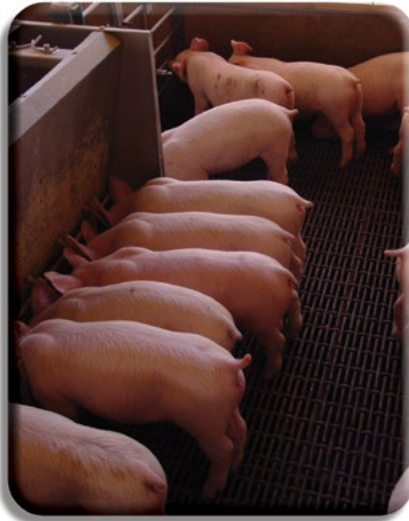
Outline: While we often talk about one national supply chain of pork (for example), the reality is that the U.S. food system is made up of smaller regional and local supply chains that are very finely balanced and built around "just in time" inventory systems.

Because the system is built around efficiency, most business up and down the supply chain (from processors to brokers to retail and food service operations) only have storage capacity for a few days' supply. When something like a large-scale restaurant closure, shelter-in-place orders, panic buying, or a processing plant closure happens, it has a major impact on the system. When all those things happen simultaneously like it did during the early stages of the pandemic, it throws the system into temporary disarray. Fortunately, we had tal-