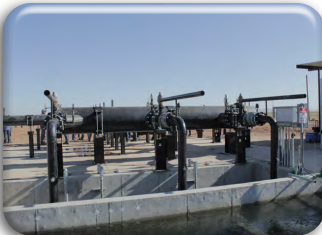
This modern water system on a Pinal County dairy is used for growing feed crops for the dairy cows. Agriculture's water efficiency continues to improve year after year.

A research student recently reached out seeking a clearer understanding of data centers' water use and its potential effects on Arizona's broader economy and communities. We dug into the topic to help provide balanced context, and we're sharing some of those insights here.