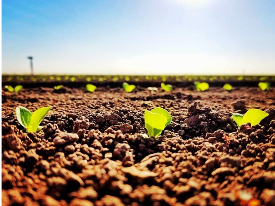
Romaine lettuce sprouting