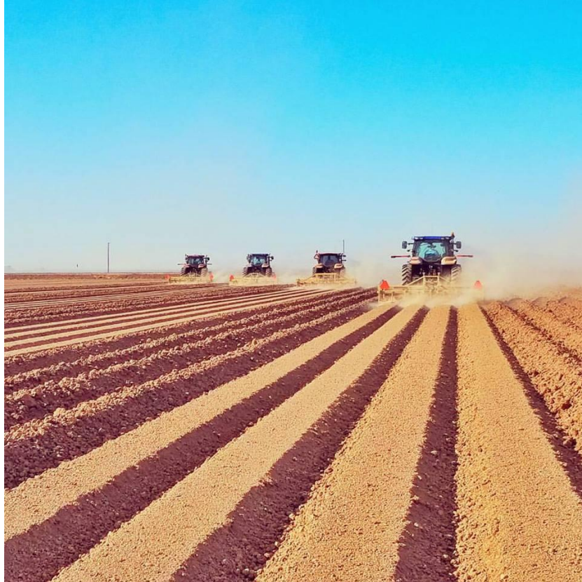
Preparing the planting beds