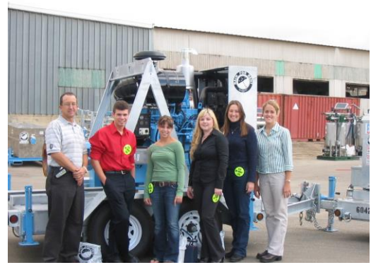
Rain for Rent Scholarship Recipients

To apply, request an Intern Application from careers@rainforrent.com and send to Rain for Rent, P.O. Box 2248, Bakersfield, CA 93303. Inquiring minds can visit our webpage www.rainforrent.com to obtain additional information about Rain for Rent's locations, products and services.